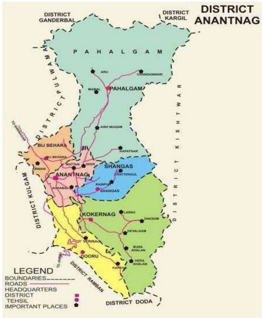
Figure 1 Anantnag and its neighboring districts

Kishtawar to its east whereas Kulgam lies to the west of the district. Furthermore, it also has Kargil to its north-east and Ramban to its south-west, while Srinagar and Pulwama lie in its north-eastern region. The details are portrayed in the map given in